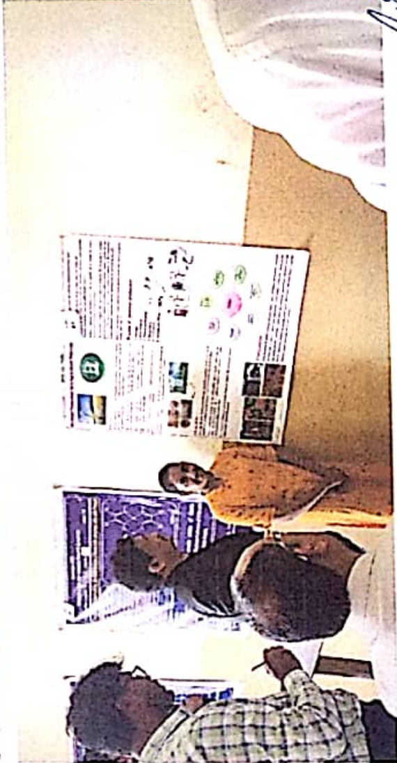
Ayishkar festival -2024 -poster competition. at parbhani

[Signature] PRINCIPAL Nutan Mahavidyalaya SELU, Dist. Parbhani